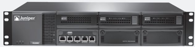
IC6500 / IC6500 FIPS